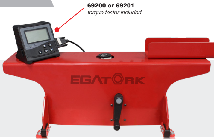
69200 or 69201 torque tester included